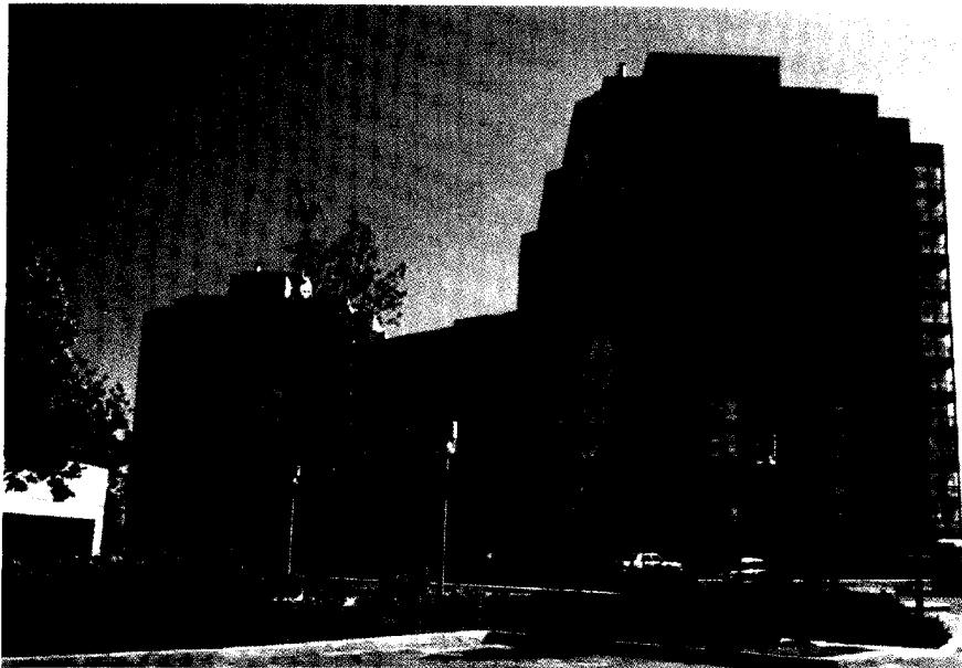
◀ Speed of construction with concrete, allowed fast occupancy of pre-sold units.